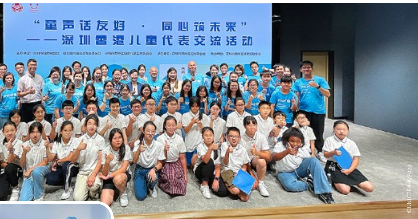
Young Envoys met children representatives in Shenzhen.

In Korea, Young Envoys were amazed by child friendly facilities they got to visit such as the Office of Ombudsman for Children, Ujiro 1216 Library in Jeonju and Wanju County Children Council that includes children in the decision making process to let their voices be heard. Furthermore, they had the opportunity to share their achievements and youth initiatives in Hong Kong with Korean and Shenzhen peer groups, facilitating exchanges with youth across borders.