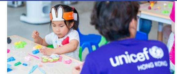
The fun day illustrated the philosophy of 'Child Ally x miffy' programme - a combination between education and fun, making for an engaging learning experience.

In order to spread the word to more families in Hong Kong, we hosted a fun day at the pulse in Repulse Bay where children were given the opportunity to explore positive impacts brought by UNICEF, helping children who are facing adversities.