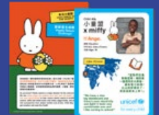
Stories + Challenges

In order to spread the word to more families in Hong Kong, we hosted a fun day at the pulse in Repulse Bay where children were given the opportunity to explore positive impacts brought by UNICEF, helping children who are facing adversities.