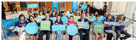
Guests attending the Runners Calling Ceremony.