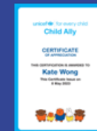
Certificate of Appreciation

By becoming a Child Ally, your child will receive a certificate of appreciation, monthly postcards and journals from miffy sharing stories of her journey around the world, as well as challenges for your child to try. Not only will you get to be helping children in need but you will simultaneously be nurturing good habits in your child.