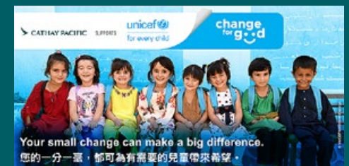
A brand new look to the Change for Good Inflight Fundraising Programme Donation Envelope

How many trips have you taken since travel restrictions were lifted? What would be the ideal way to make good use of the remaining foreign currency change in your pocket? You can support Change for Good Inflight Fundraising Programme operated by Cathay Pacific and UNICEF HK, by simply putting the remaining change into the envelope. Your kind donation in any denomination and currency can make a big difference to vulnerable children worldwide.